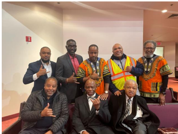
Ebenezer Brothers of Alpha Phi Alpha Fraternity, Inc. Scholarship committee after Sunday worship service